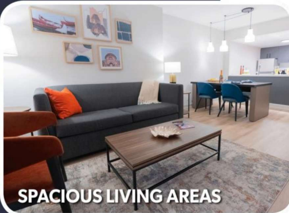
SPACIOUS LIVING AREAS